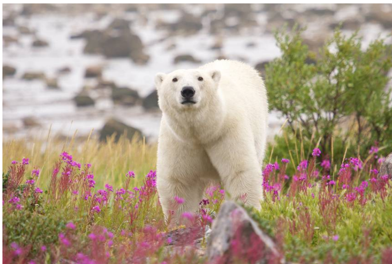
Polar bear wading through blooming Arctic foliage.

impacted slightly by temperature, Arctic plants are actually less sensitive to changes than plants that grow in more temperate climates 10 . However, they were significantly more vulnerable to the indirect effects that an increase in temperature will trigger-- specifically the rate of resource acquisition 10 . Another concern is that as northern temperatures increase, species that typically grow in warmer climates will begin to encroach on Arctic territories. A case study done by Stubbs et al. (2018) used purple saxifrage to study the implications of climate warming on cold-adapted plants. The results showed that under current warming predictions, there would be an average geographic area loss of 72% of cold-adapted plants as they are forced to migrate further North-- both as they are pushed out by incoming temperate species and forced to seek an area that meets their temperature requirements 11 . The loss will be even greater for species that grow in high elevations as their ideal climate, unable to shift to a colder environment as it will not exist, will disappear 11 .