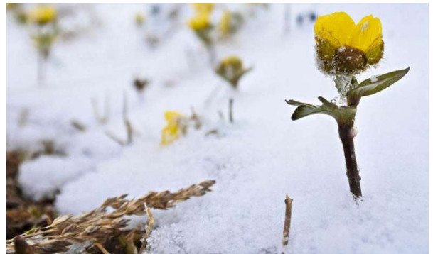
Snow buttercup emerging after winter.

When someone says the word Arctic, what comes to your mind? Perhaps it is a vision of an Eskimo, wading through the blowing snow of a winter blizzard in pursuit of dinner for his family. Or maybe it is those old Coca-Cola commercials that come to mind, and you imagine a polar bear lounging on an iceberg with its pups. To most, what comes to mind is a limitless expanse of snow and ice. In fact, type 'Arctic' into Google images and this is exactly what you will find.