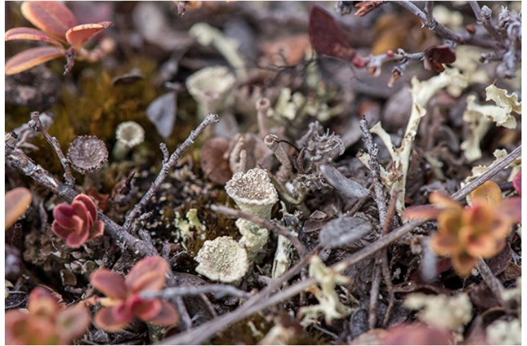
The boreal pixie-cup lichen (Cladonia borealis) can be found on soil and rock in arctic and alpine regions.

Mosses are also an essential part of the Arctic ecosystems. With waters that typically hover around 0°C, mosses are often the only multicellular plant that can grow in aquatic environments. Mosses grow slowly-- as little