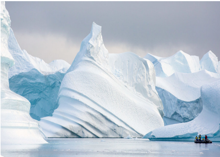
Majestic ice formations in Greenland

The Dire Implications of Arctic Warming in the Age of Climate Change