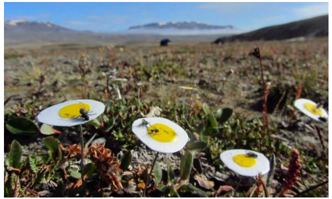
Flies are one of the main pollinators in the Arctic.

likely however, as these seasonal changes will alter the relationship between plants and their pollinators. Phenological research shows that changes in flowering and gamete production due to temperature changes can alter the relationship between pollinator and plant 15 . While this can have rebounding effects on all plants that rely on fertilization for reproduction, the effects would be stronger for those that rely fully on pollinators to propagate their lineages. Research on Arctic plant and pollinator interactions seem to suggest that this mismatch would more strongly affect plants that bloom early in the season than those that bloom later 15 . However, they recognize that the subtleties of these changes are hard to predict and many Arctic plant-pollinator interactions are unknown. One of the final impacts of phenological mismatches is on the relationship between plants and their consumers. Simulated mismatch scenarios show important interactions between the peak of plant production and migration